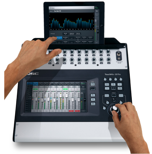
Shown with optional Tablet Support Stand and iPad® (not included)