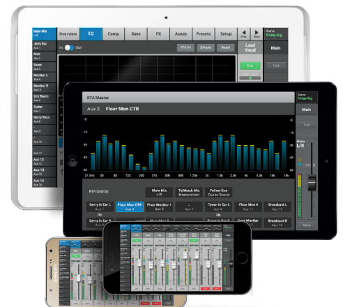
TouchMix Control App for iOS® and Android™ devices

Modern digital mixing consoles are all fully featured — sometimes to the point of being nearly incomprehensible to all but the most experienced operator. The TouchMix design team set out from the start to create a mixer with an intuitive workflow and straightforward navigation that is understandable for the less experienced user and fast for the professional — all without sacrificing features or capabilities. As a result, the mixer is extremely easy to learn and operate. Many TouchMix functions such as EQ, compressors, gates and limiters offer a choice of Advanced Mode operation with total control over all parameters or Simple Mode that presents only the most essential controls.