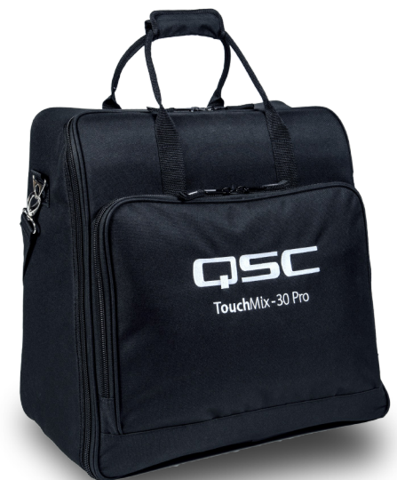
TouchMix-30 Pro Tote